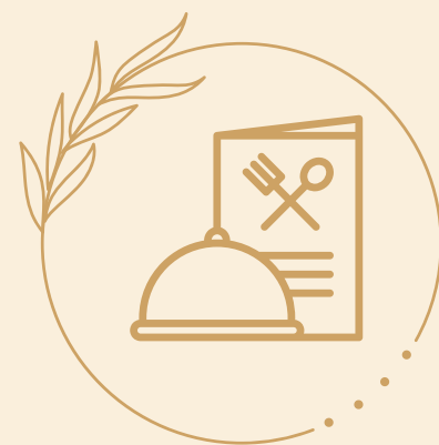
RESTAURANT AND CONFERENCE ROOM