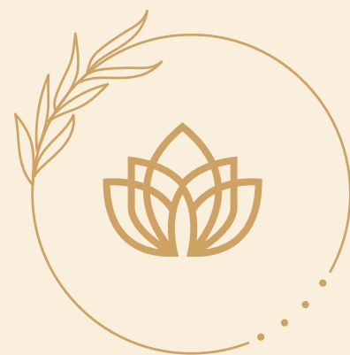
SPA ZONE & WELLNESS