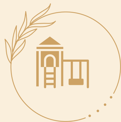
PLAYGROUND FOR CHILDREN